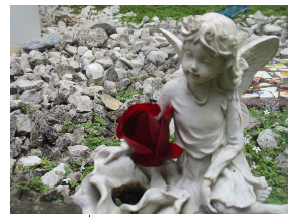
Page 5 TCF Otago June July 2022