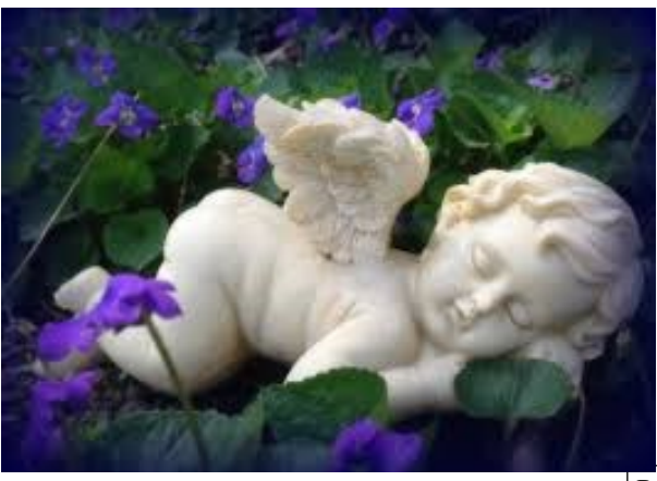
Page 9 TCF Otago April May 2023

Gratefully reprinted from TCF Victoria Chapter Newsletter