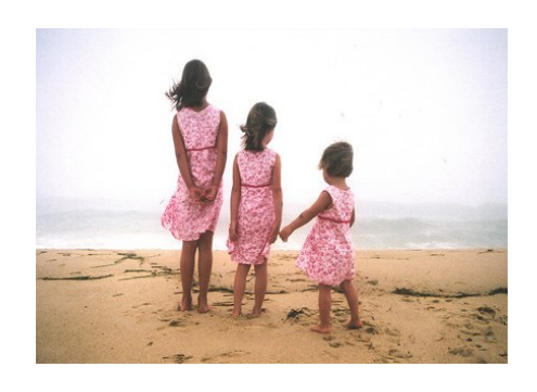
Page 15 TCF Otago Oct Nov 2023